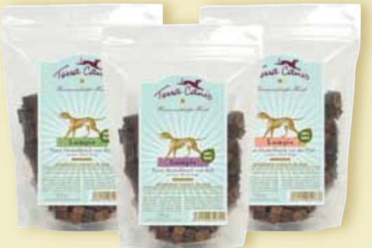
Lumpis are available in the types «beef muscle meat», «beef heart meat», «turkey», «venison muscle meat» & «rumen».

Lumpis® and Wuffels® consist of pure meat. This is gently air-dried, a touch of seaweed is added and then divided into small pieces - to fit easily into a dog's mouth: From a size point of view, our Lumpis® are suitable for large and middle-sized dogs, Wuffels® are more appropriate for small dogs and puppies. For these products we use exclusively veterinary controlled products from Bavaria. It goes without saying that both products, as all our other products, are free of chemical colorants and preservatives. They contain no cereals so even sensitive dogs can enjoy these special treats!