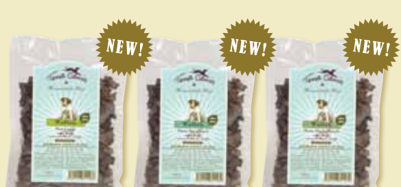
Wuffels are available in the types «beef tongue», «beef heart meat» & «beef muscle meat».